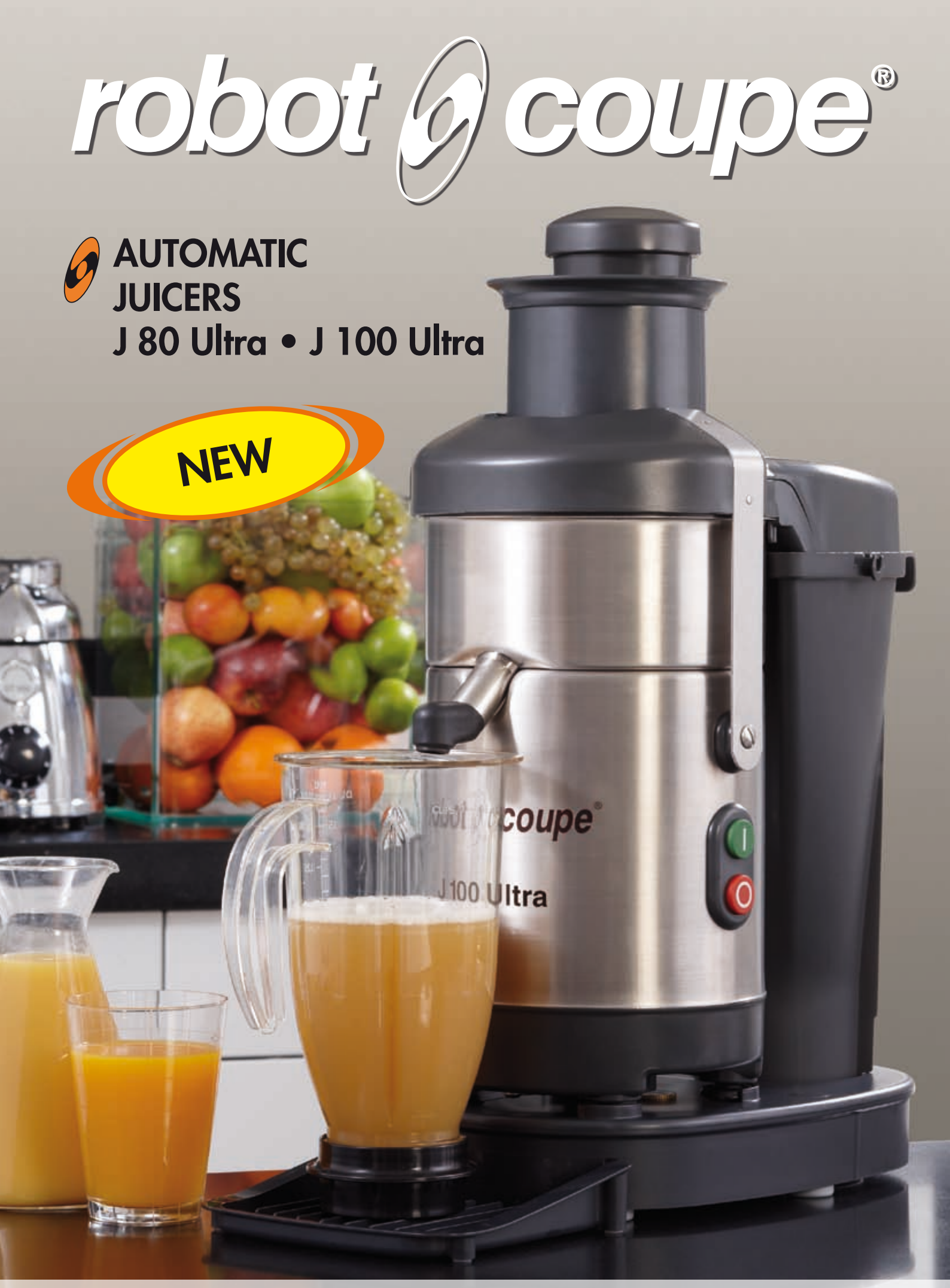
BARS - TAKEAWAY OUTLETS - RESTAURANTS - HOTELS - CANTEENS